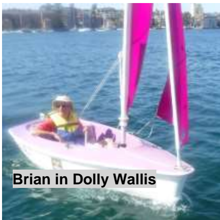
Brian in Dolly Wallis

Today was a good day for training carers for our participants, soon to return, we hope. Kel