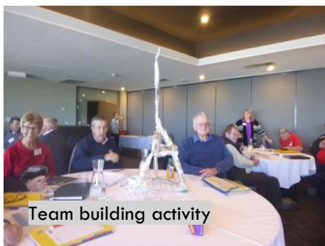
Team building activity

Most delegates stayed in close proximity for the weekend, at the closest caravan park, so there were also lots of opportunities for socialising and discussing convenient ways of doing things.