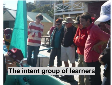
The intent group of learners