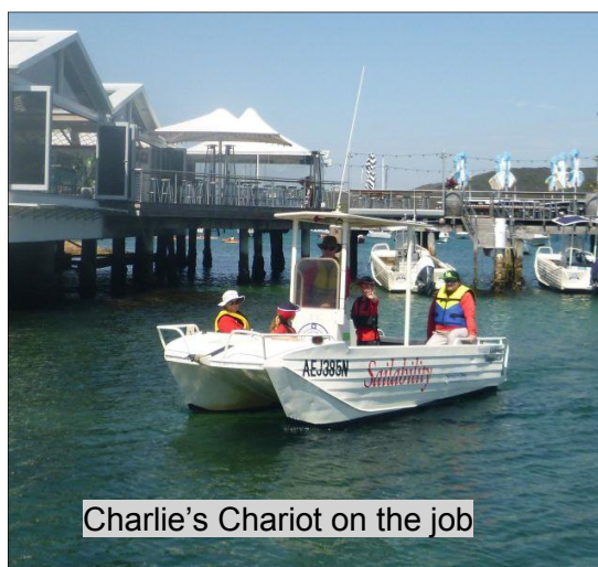
Charlie's Chariot on the job