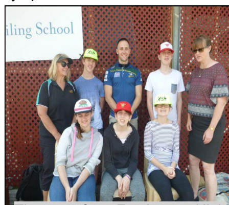
The team from Freshwater High

the 303's drove Charlie's Chariot, observed, took photos, sailed, washed and put away boats and. There were no spare people standing around, every member of the team was either sailing, or working in another capacity.