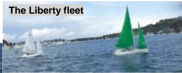
The Liberty fleet