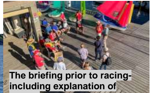
The briefing prior to racing including explanation of marks!