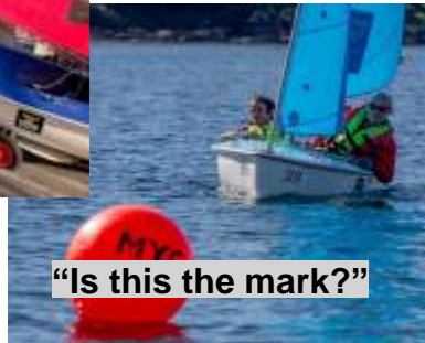
"Is this the mark?"