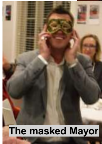
The masked Mayor