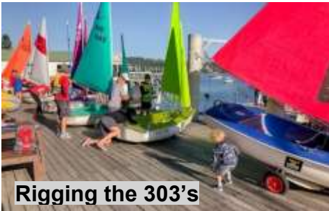
Rigging the 303's