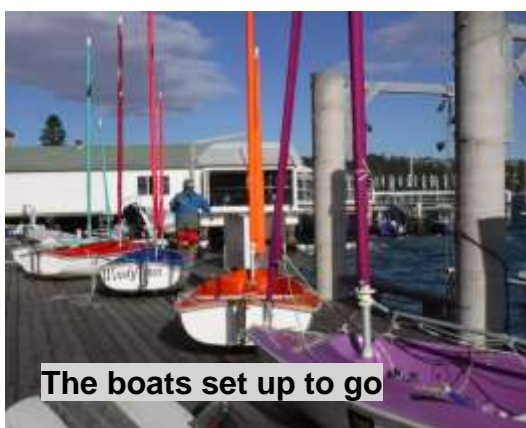
The boats set up to go