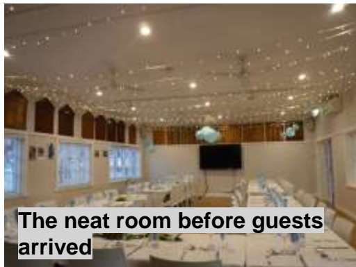
The neat room before guests arrived