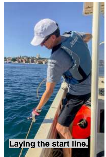
Laying the start line.