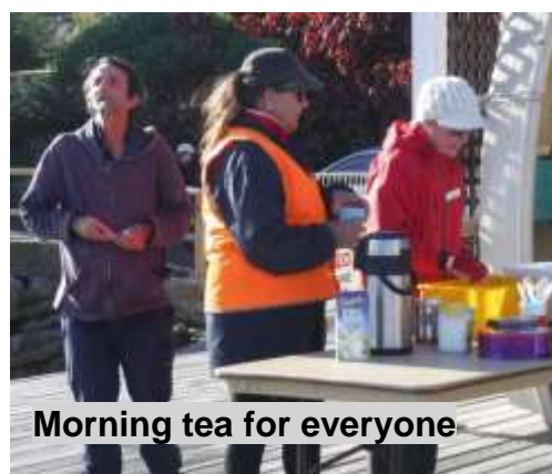
Morning tea for everyone

This was one of those, a strong Westerly breeze that only became stronger, and wilder and woollier throughout the morning, and lots of eager people who had come to Manly to enjoy the gusty Autumn Day.