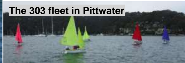
The 303 fleet in Pittwater