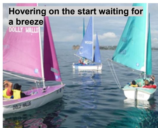
Hovering on the start waiting for a breeze