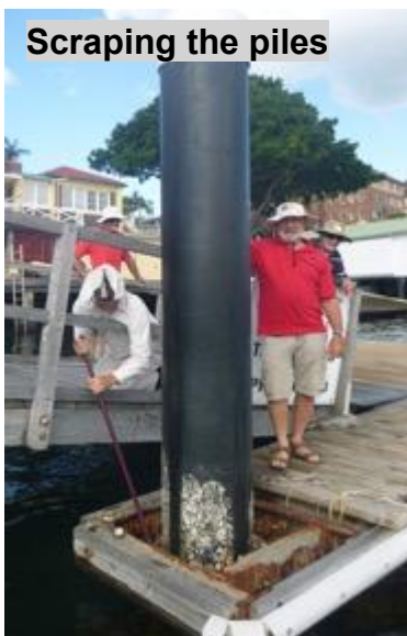
Scraping the piles

Thank goodness, the weather forecast for the day was way off the mark. What was forecast to be a rainy, windy day with strong gusts turned out to be mild, with a steady breeze from the west making an ideal day to take lots of participants out on the water, giving them and their carers a lovely break from routine.