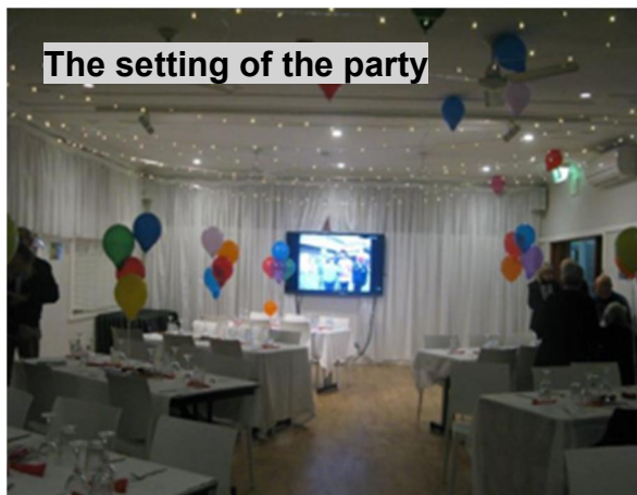
The setting of the party

Volunteer Recognition Evening, 3rd May, 2017. It was a truly beautiful evening when 44 excited people arrived at Manly Yacht Club at the other end of the day from our usual routine. The sun had set, the lights were on, including new Fairy Lights courtesy of Manly Yacht Club. The purpose was to celebrate the 21st Birthday of Sailability Manly along with our