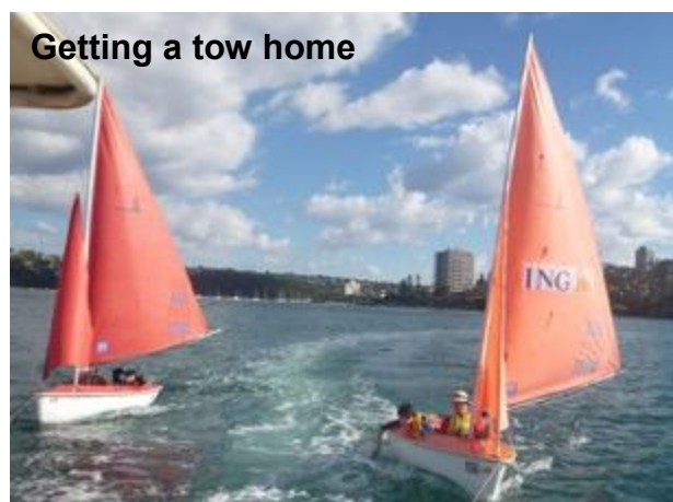
Getting a tow home