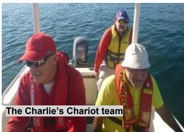
The Charlie's Chariot team