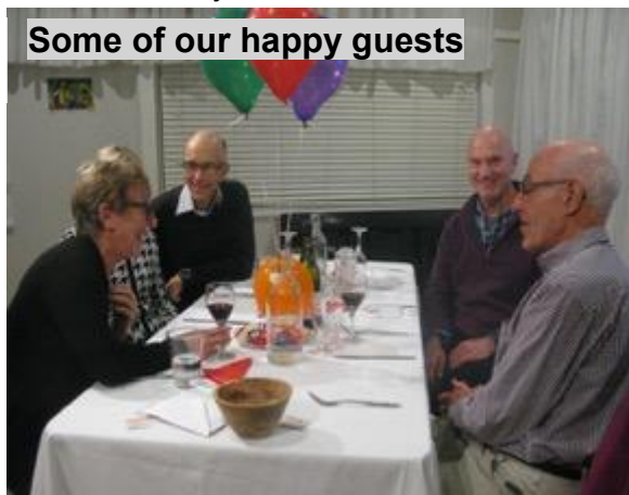
Some of our happy guests