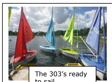
The 303's ready to sail.