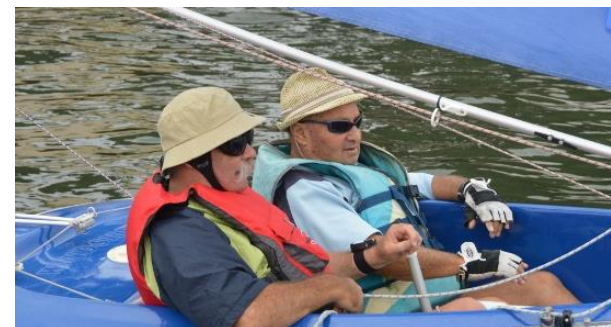
The winners leaving the pontoon

count back, so the first place getters were Woody, Th ING and Lionheart with the remainder of the boats coming in very quickly.