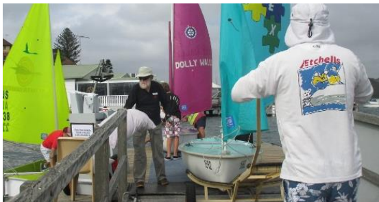
Getting the boats rigged