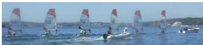
Sharing Manly Cove with us