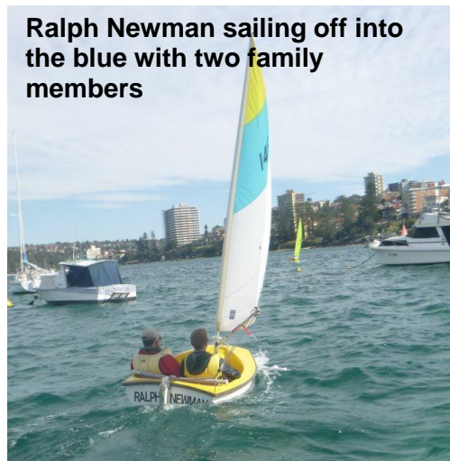
Ralph Newman sailing off into the blue with two family members