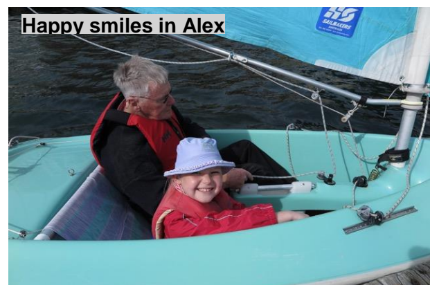
Happy smiles in Alex