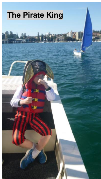
The Pirate King