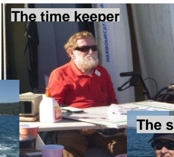
The time keeper