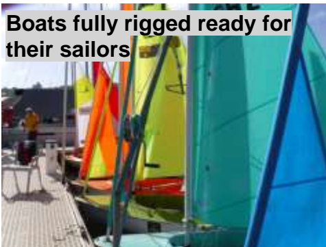
Boats fully rigged ready for their sailors

What a fabulous day Sailability Middle Harbour put on just for fun to celebrate another year of Sailability in NSW.