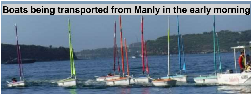
Boats being transported from Manly in the early morning