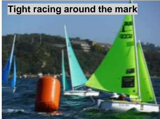
Tight racing around the mark